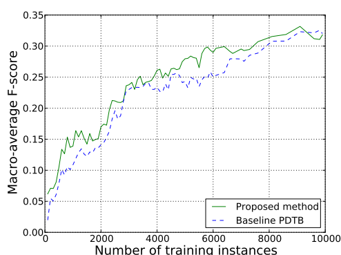
Figure 3: Macro-average F-score (PDTB) as a function of the number of training instances used.

the method on two of the most widely-used discourse corpora, RST-DT and PDTB. The method performs significantly better than a baseline classifier trained on the same features, especially when the number of labeled instances used for training is small. For instance, using 1000 training instances, we observed an increase of nearly 30% in macro-average F-score. This is an interesting perspective for improving classification performance of relations with little training data. In the future, we plan to improve the method by employing ranked co-occurrences. This way, only the most relevant correlated features can be selected during feature vector extension. Finally, we plan to investigate using larger amounts of unlabeled training data.